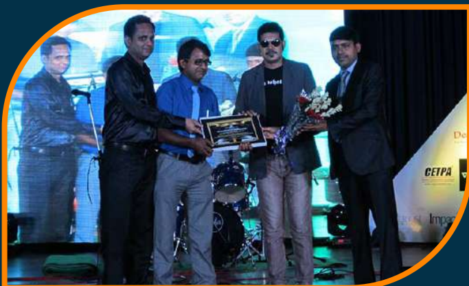
CETPA received "State Excellence Award" by PMI