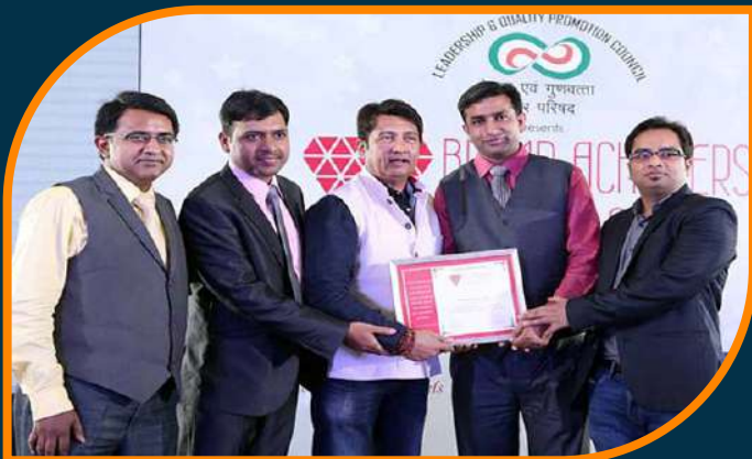
CETPA received "Brand Achievers award" by Shekhar Suman.