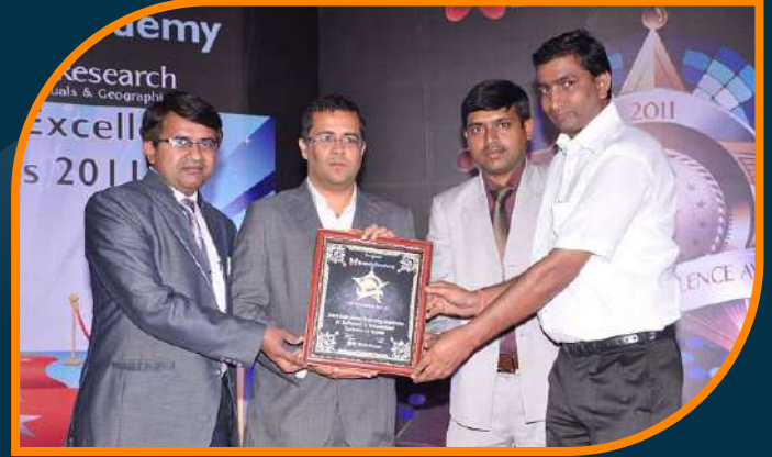
CETPA received "Top IT Training Company" award by Chetan Bhagat for quality training.