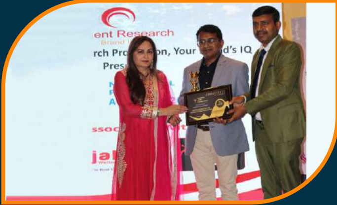
CETPA received "Best Talent Acquisition Company" by Jaya Prada