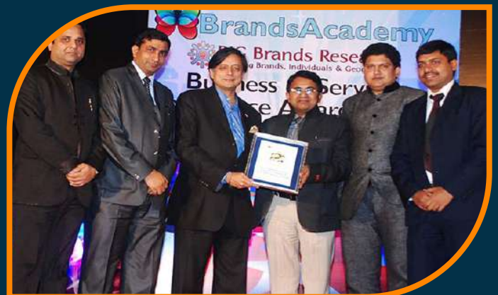
CETPA was dignified with "Best Industry" award by Shashi Tharoor.