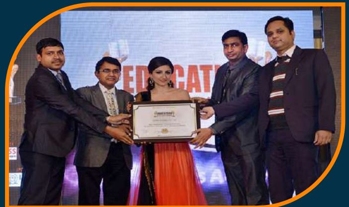
CETPA received "Best Education and Training Company" award by Soha Ali Khan.